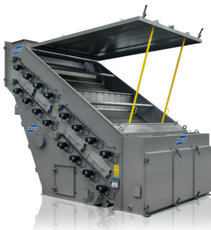
Fig.3: RHEWUM WAU screening machine with direct excitation of the screen cloth.

The mesh openings were optimised during test trials in the RHEWUM pilot plant in Remscheid. Directly excited screen cloths with an automatic cleaning cycle keep the screen cloths free from clogging. Every screen cloth can be changed individually without removing any of the others, which is very useful considering that different wear of the screen cloths can lead to individual maintenance intervals. The screen cloths are tensioned by tensioning ledges with only four clamping nuts. Between the tensioning ledges and clamping nuts Belleville spring packages are installed to make the screen mesh more flexible and self-tension itself in case of wear or high temperature. A protection sleeve keeps the dust away from each screw and ensures easy replacing. In total there are only four screen cloths installed and each can be replaced within just ten minutes.