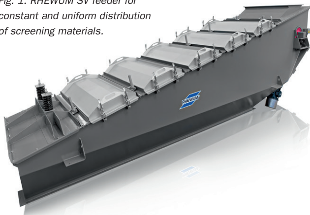
Fig. 1: RHEWUM SV feeder for constant and uniform distribution of screening materials.

The most important contact part of the screening machine with the urea is the screen cloth. Choosing the right mesh opening will create a high quality product. In addition, a constantly open screening area will increase the plant capacity and reduce the costly recirculation of material. Easy and fast maintenance of the screen cloths will lead to high availability. All these points have been incorporated into the design of the main screen cloths.